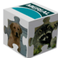
Rabies North America