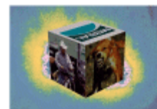
Rabia en las Américas